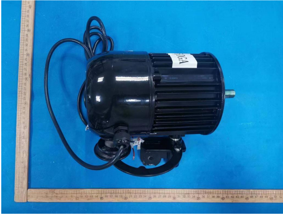
Figure 1: Outlook view