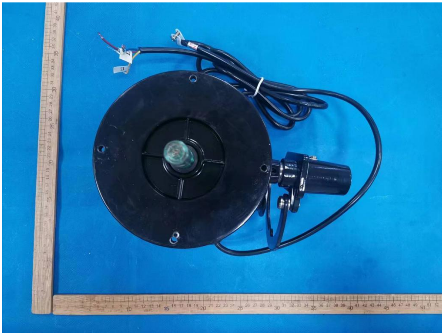
Figure 2: Outlook view